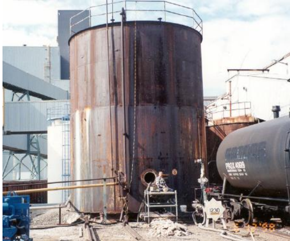
Weyerhaeuser, Dryden, Ontario Plant