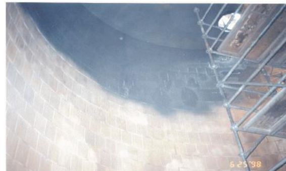
Coating Steel Roof and Tile Area