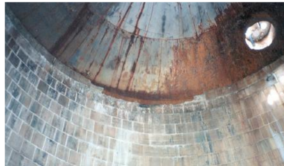
Interior Prior to Rehabilitation

head, may be installed to rehabilitate tanks with serious structural deficiencies.